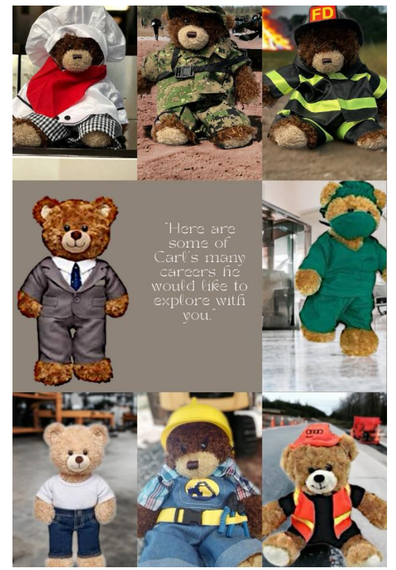
Carl the Career Bear for elementary school students.

Highlights of our achievements in the current quarter include tracking over 80 individual career connection activities. These activities encompass Career Connect Events, Career Cruises, Virtual Career