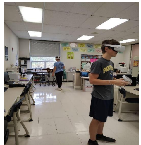
Virtual Reality Career Exploration at a local high school

To maximize the impact of our Business Education Program (BEP) funding, we've strategically employed staff to establish strong connections with schools. Leveraging these relationships, we actively participate in the planning and execution of various career exploration events across almost all schools. Our focus is not only on promoting opportunities within our region but also providing students, teachers, parents and others with insights into the skills and knowledge required for local jobs and assisting our schools in meeting their PA Department of Education (PDE) career education benchmarks.