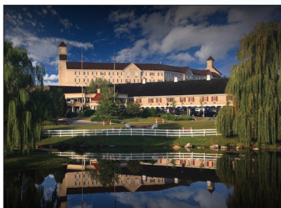
Hershey Lodge & Convention Center West Chocolate Avenue & University Drive Hershey, PA 17033 717-533-3311

When making your reservations, advise the lodge that you are attending the “Bureau of Workers’ Compensation Conference June 1-2, 2023” to get the conference room rate of $179, plus 11 percent tax per room, per night . If you are attending and exhibiting, make the lodge aware of that as well.